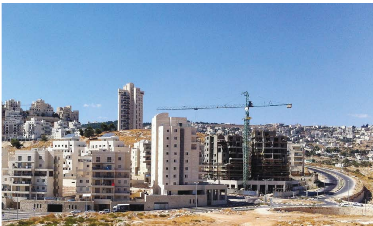
Expansion of Har Homa against the backdrop of Sur Baher, where planning and construction is restricted