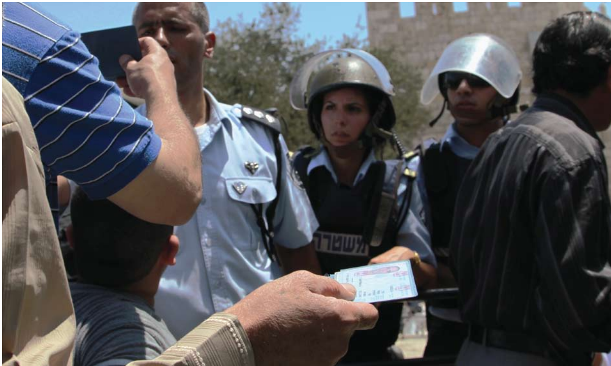
Checking identity cards near Damascus Gate

not have any inherent and a priori right to receive such a status.” 33 In other words, the Palestinian residents of Jerusalem are considered foreign nationals whose residency is an act of grace, rather than a right. Eli Suissa of Shas, who served as interior minister from June 1996 through July 1999, saw this policy as an important component in the struggle to maintain a Jewish majority in Jerusalem, and stated openly that he sought to increase the Jewish majority “to over 80 percent.” 34