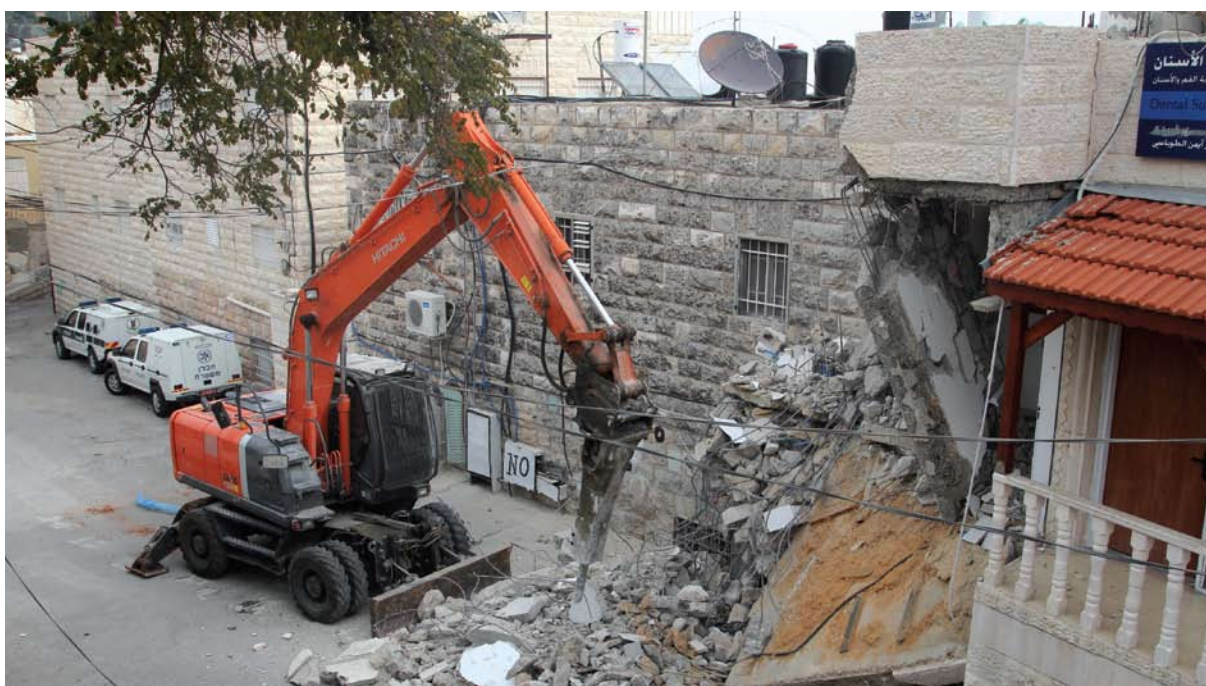
Demolition of a house in Jabal Mukaber

the instruction of former Interior Minister Eli Yishai, who opposed the approval of additional construction in Palestinian neighborhoods of East Jerusalem. 20