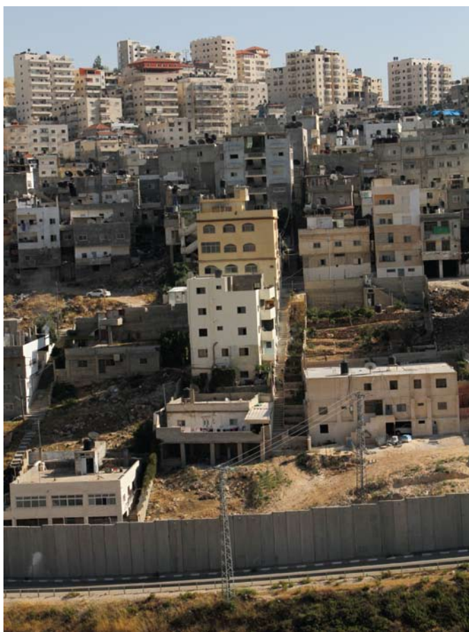
Shuafat Refugee Camp, with Ras Shehadeh in the background

In contrast to its activities in other parts of Jerusalem, the Municipality does not contact organizations representing the residents, such as neighborhood committees, or international organizations such as UNRWA, to prepare residents for a potential disaster. Theoretically, it would be possible to strengthen the buildings, but it is unlikely in the current circumstances. Von Toggenburg adds that in order to prepare for possible disasters in the refugee camp, UNRWA has begun to conduct emergency preparedness trainings for teams of local residents. The agency has invited experts in the rehabilitation of favelas from Latin America who tackle the massive slum neighborhoods alongside the major cities of Brazil, also constructed illegally and without suitable infrastructures. 122