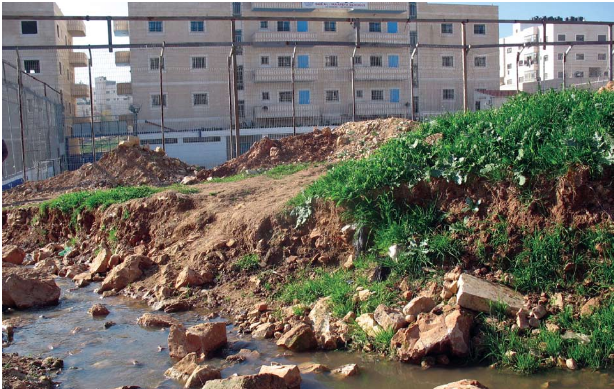
Sewage near a school in Kufr Aqab

beyond the Barrier. The investigators are accompanied by private security contractors. 94 Investigations involve intrusive questions and examinations concerning residents' lifestyles, family lives, and homes, as well as questioning of relatives and neighbors. Such investigations require a level of sensitivity and professionalism that cannot be provided by a contractual body disconnected from the institution that provides the service. Residents who have undergone questioning perceive the investigators as being highly motivated to lead the investigation to conclusions that would substantiate revocation of their residency status. 95