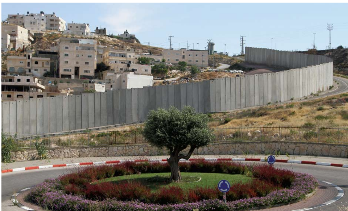
A view from Pisgat Ze'ev to Ras Khamis

As we saw in Chapter One, since Israel annexed East Jerusalem it has repeatedly declared the “unity” of West and East Jerusalem. However, this unity relates solely to the land of East Jerusalem and not to its Palestinian population – residents who are not Israeli citizens. These residents have faced massive pressures, including profound neglect in the provision of physical and social infrastructures, a grave housing crisis, and ongoing threats to their residency status. Construction of the Barrier intensified the division and segregation of Palestinian space in Jerusalem, disconnecting entire neighborhoods from their municipal lifeline and from sources of livelihood and identity. This policy has consistently pushed the poorer and weaker residents of East Jerusalem into the neighborhoods beyond the Barrier.