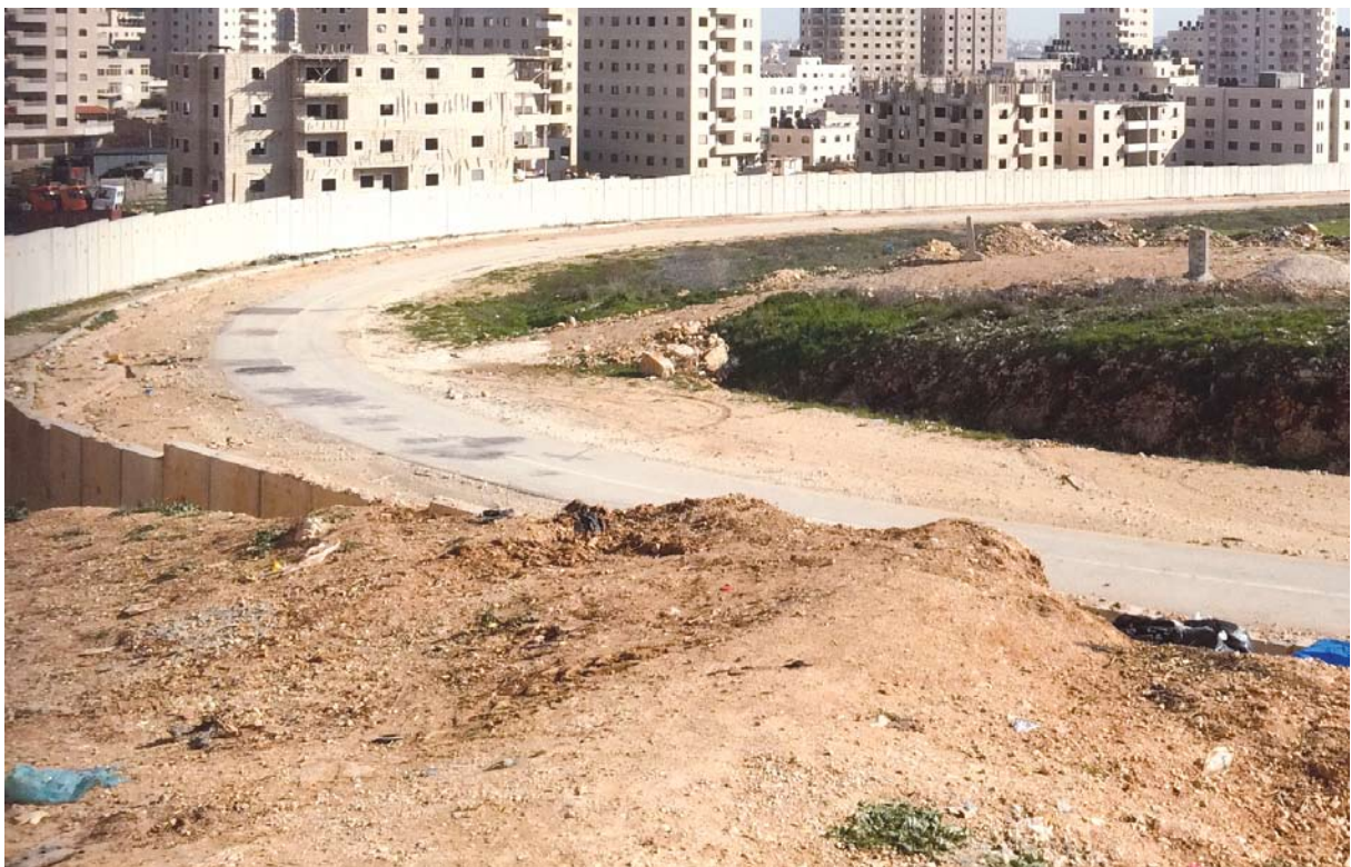
Kufr Aqab, beyond the Separation Barrier

The Separation Barrier disconnected Palestinian neighborhoods that had formed an integral part of the city since 1967 and whose residents are Jerusalemites who hold Israeli identity cards. In the northeast of the city, the Barrier uprooted large Palestinian neighborhoods from the city that have formed part of its municipal area since they were annexed to Israel in 1967. Kufr Aqab and Semiramis lie to the north of Atarot (Qalandiya) airfield, while the areas left to the northeast of the Barrier include the Shuafat refugee camp and its adjacent neighborhoods of Ras Khamis, Ras Shehadeh, and Dahiyat al-Salaam (“New ‘Anata.”) According to various estimates presented below, these neighborhoods have a total population of up to 100,000 Palestinians, the majority of whom are Jerusalem residents and many of whom previously lived in Palestinian neighborhoods within the Barrier. Most of them are employed in Jerusalem inside the Barrier, shop in the city, and meet there with friends and family. Their children attend educational institutions in the city and they use health and religious services in the city. These residents are subject to Israeli rule and law, belong to the Jerusalem Municipality, and live within the city limits. In historical and political terms, they are Jerusalem residents, and the city is their homeland. Despite all of these ties, they have been uprooted from their city – or, perhaps more accurately, their city has uprooted itself from them.