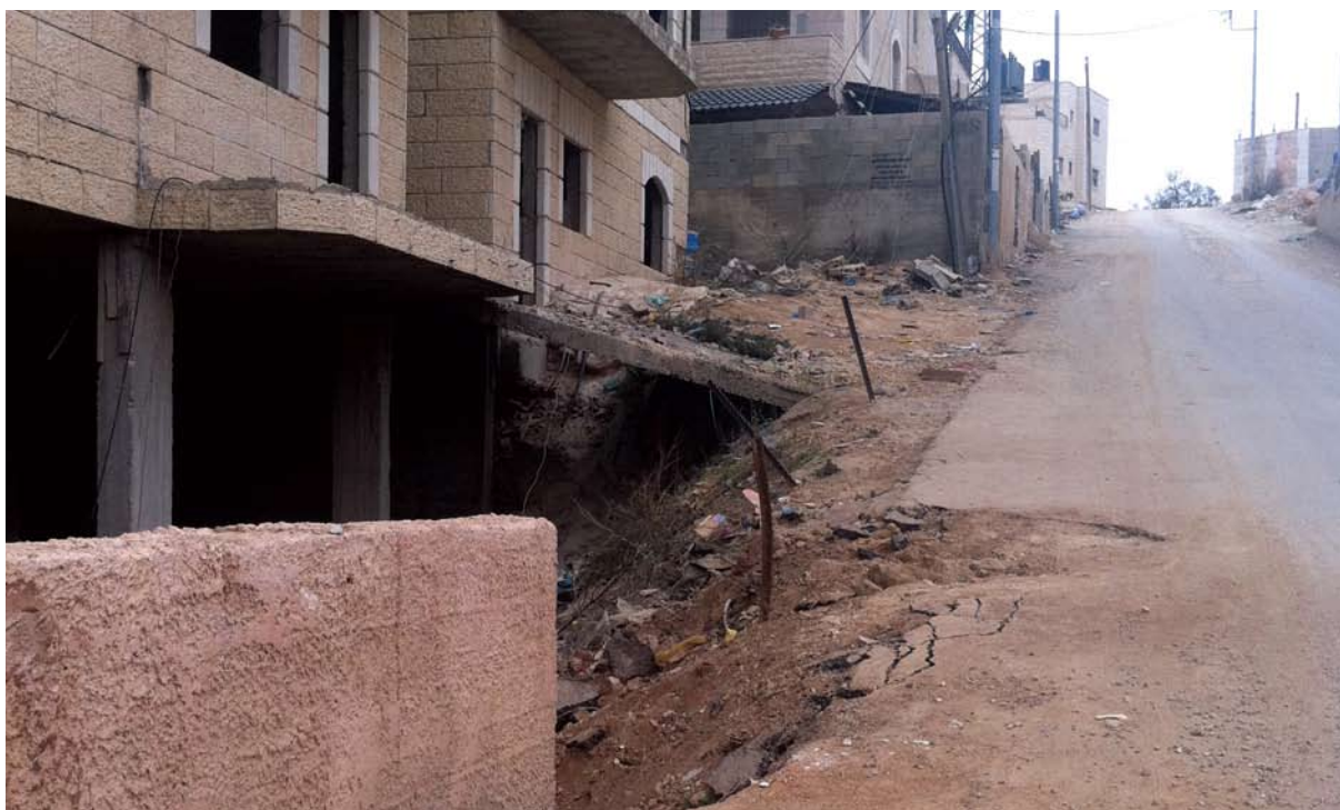
Collapsed road in Kufr Aqab

arrangement is maintained that permits its implementation.” 85 This is not the only instance in which security has been used as a pretext for withholding services from the residents of the neighborhoods beyond the Barrier, despite the fact that the unique security situation in these neighborhoods is a direct result of the actions of the Israeli authorities. Moreover, and as emerges from Attorney Liebman’s comments, the issue of security has become a means for transferring responsibility from the civilian authorities to the military. The significance of this process will be discussed in greater detail.