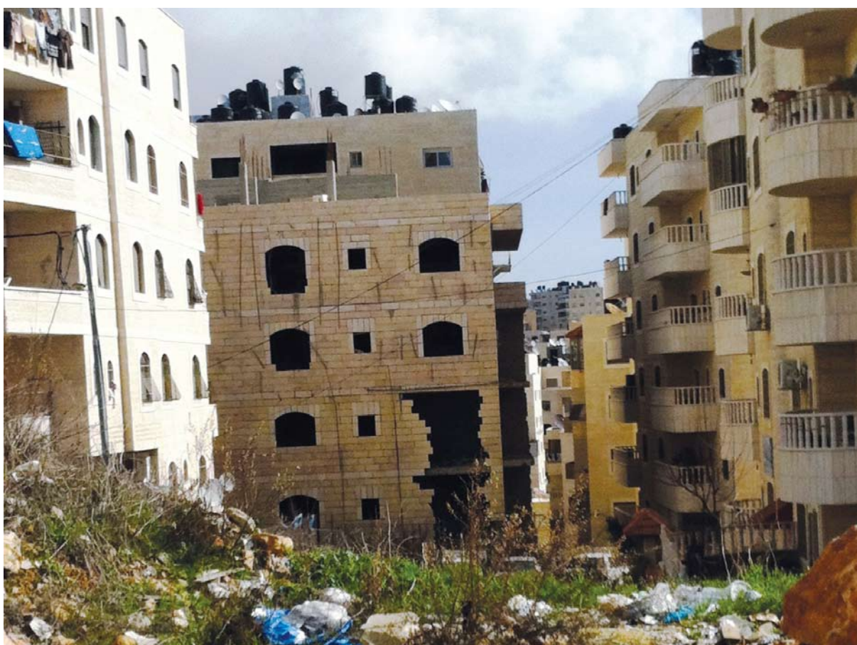
Collapsed wall of a building in Kufr Aqab

Following establishment of the Barrier, a process of rapid construction began in the neighborhoods of Kufr Aqab-Semiramis and in and around the Shuafat refugee camp. Construction was driven by the enormous demand for available and relatively cheap housing solutions among East Jerusalem residents who had been pushed out of the core neighborhoods of the city by political and socioeconomic developments. The massive demand for housing attracted entrepreneurs and contractors who had identified a tremendous economic opportunity, enhanced by the lacuna in land registration, construction inspection, and enforcement (see Chapter One).