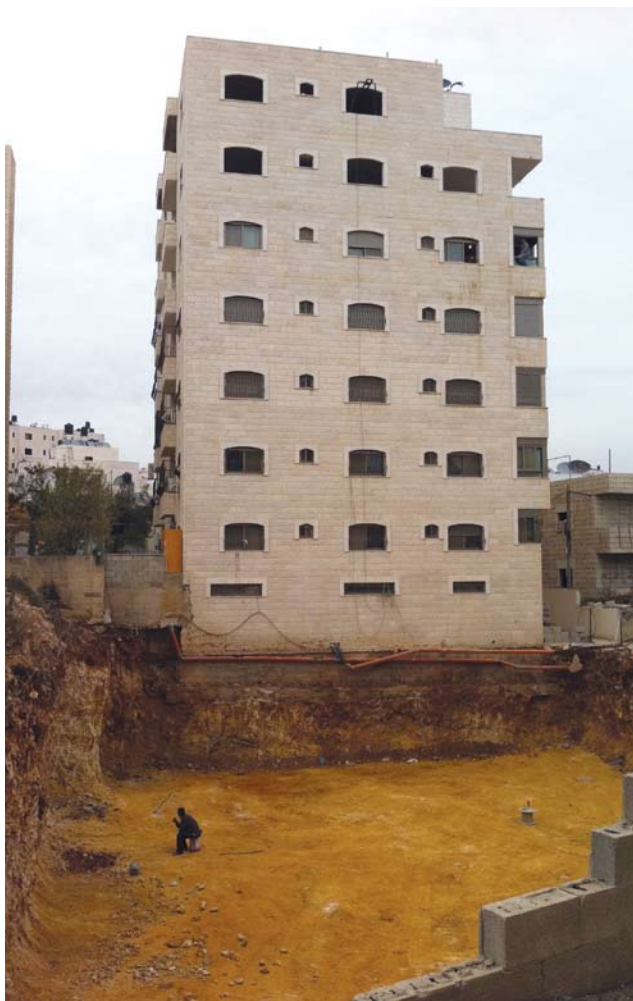
Building density, Kufr Aqab: Adjacent to the exposed foundation of one building, a hole is already being dug for another building

and impaired commercial stability. In this way the neighborhoods became slums controlled by criminals... 115