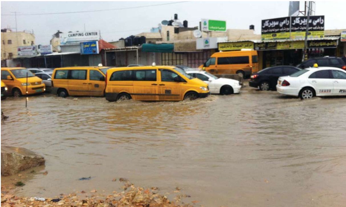
Main road in Kufr Aqab, near Qalandiya Checkpoint

Fire authority representatives admitted to particularly long response times, requesting allocation of land in the Qalandiya area for construction of a fire station. 86