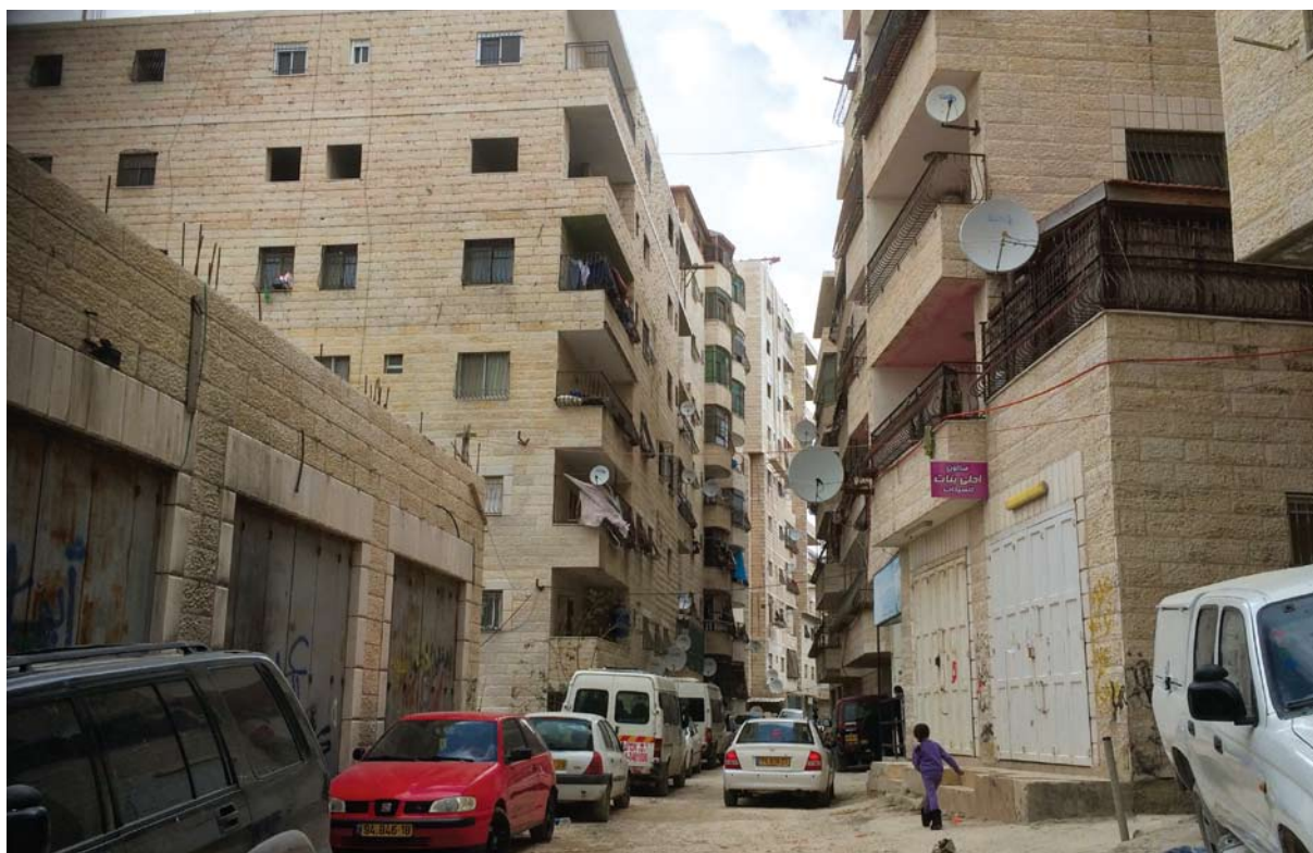
Building density in Ras Shehadeh

Following the annexation of the Shuafat refugee camp to the Jerusalem city limits, residents insisted on their status as refugees and on the presence of the United Nations Relief and Works Agency (UNRWA), the body responsible for providing services and employment for Palestinian refugees. 74 As a result, and with the exception of garbage collection, since 1967 the Jerusalem Municipality has ignored the needs of the Shuafat camp, claiming that UNRWA is responsible for the area. UNRWA continues to provide education, welfare, and medical