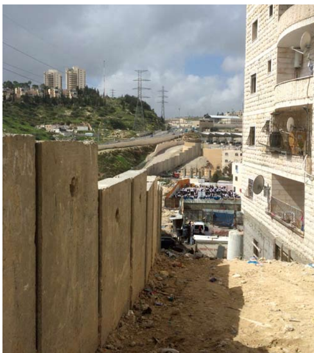
Ras Shehadeh against the backdrop of French Hill

of address. Moreover, both these areas saw under-reporting in the most recent census. 64