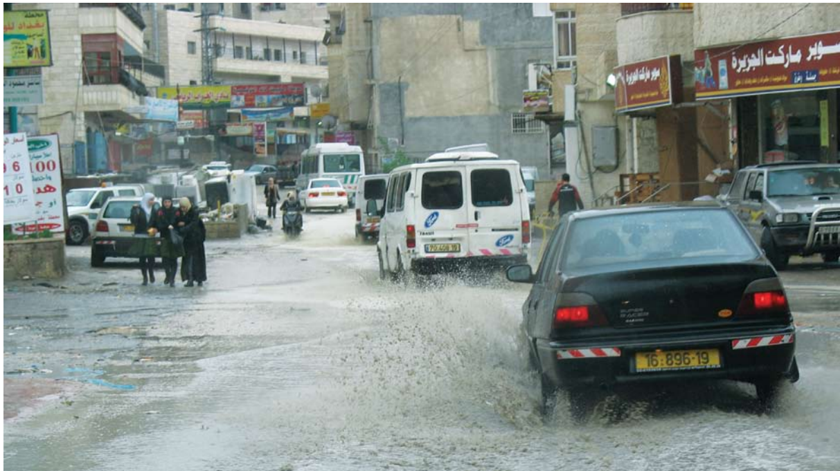
Main road in the Shufat Refugee Camp

be solved by widening the main water pipes but refused to install additional infrastructure or to connect homes to the grid, claiming that most of the residents live in homes constructed without permits. The petitioners argued that such action would not solve the problem and would only perpetuate the violation of residents' basic rights. They further argued that residents had no recourse but to construct homes without permits due to the authorities' long-standing failure to plan the area. And, according to the petitioners, in similar instances solutions had been found enabling the connection of homes to the water grid.