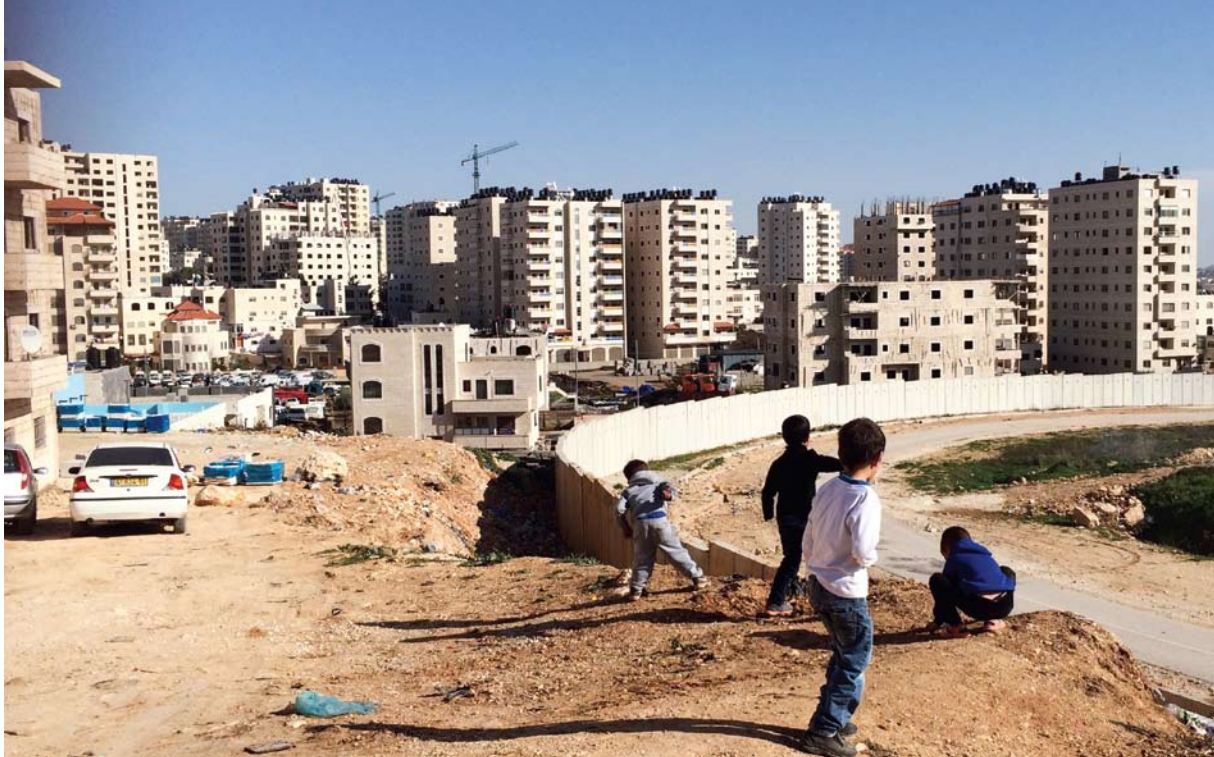
Kufir Aqab, view from the Separation Barrier

In June 1967 Israel annexed East Jerusalem, which had been under Jordanian rule, together with an additional 60 square kilometers of land in surrounding areas of the West Bank (henceforth, "East Jerusalem"). These areas were absorbed within the municipal boundary of the city. Approximately one-third of the annexed area was confiscated as part of a massive program to construct neighborhoods/settlements along the border of the annexed area, serving as buffers between the Palestinian neighborhoods and between the city in its new borders and the West Bank. Additional areas were confiscated, formally or in practice, by means of their declaration as national parks or green areas. Palestinian residents of East Jerusalem received the status of permanent residents, which left them excluded from both the Israeli and Palestinian political systems, creating a situation unparalleled in the Western world: an ethnic community deprived of civil and political rights within a democratic regime.